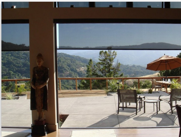
Solar shade screens offer enhanced protection from harmful UV rays.